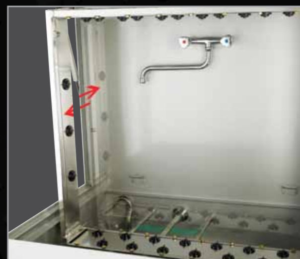
Only JEROS machines offer a system with a moving wash frame. A unique system ensuring superior washing results.

JEROS Compact is used primarily by medium-sized companies requiring a high-pressure machine such as butchers, dairies and special industries.